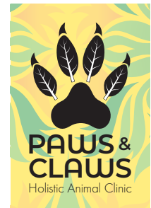
Black Logo on Background Image

Separating the Paw from the text and placing them inline with each other is appropriate. Their proportions must be maintained, and all other rules are to be observed.