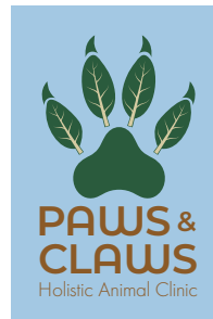
Color logo on Sky Blue

Logo may be placed on a background that provides good contrast, legibility and visibility.