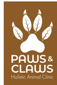
White Logo on Soft Brown